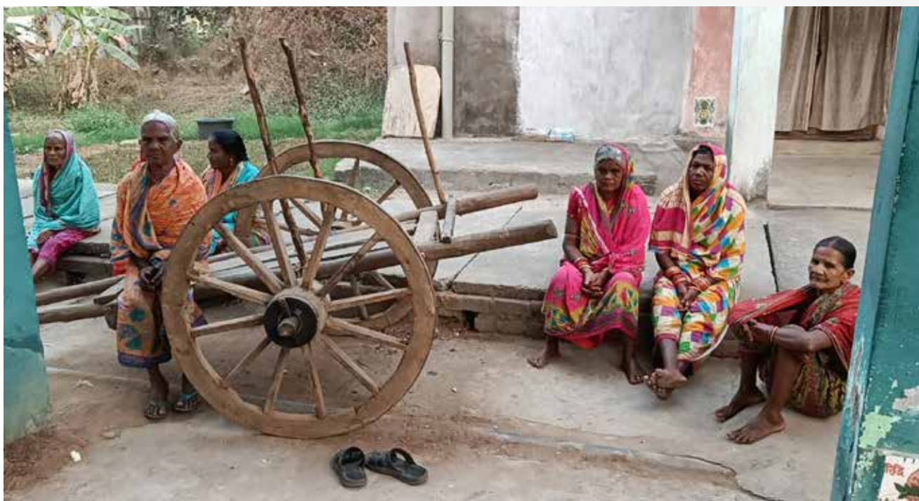
Women of Bantabori sahi in Angul, Odisha.