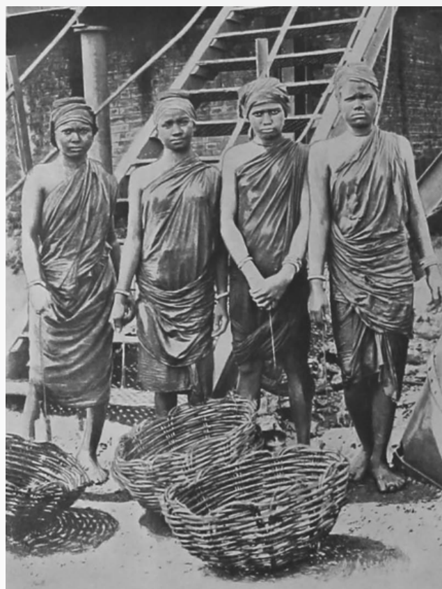
Women workers leaving a wet coal mine with soaked garments clinging to the skin. Source: Annual Report of Chief Inspector of Mines in India, 1927

By the 1920s, however, there was a shift away from open cast mining to shaft or pit-mining and because of high capital investments this led to preference for a more stable and skilled workforce among colliery owners (ibid.). This ruled out the adivasis for whom commitment to land as farmers trumped their work in the coal mines (ibid.). Coal mine companies started engaging contractors who brought in labour from