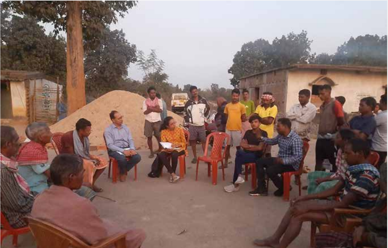
TERI team having a discussion with the tribal residents of Orampada village of Sundargarh, Odisha

We don't want to see an energy transition divide and we don't want to leave any community, individual or region behind. To do this ADB launched a Just Transition support platform at COP27 at Sharm-el-Sheikh. ADB like many other MDBs has signed on to a just transition high level principles to articulate what we see as a common understanding of just transition and to guide our operations.