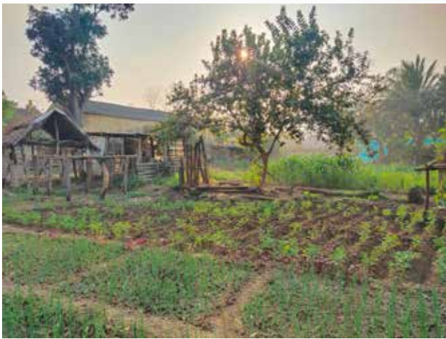
Kitchen gardens were a common site in Bantabori sahi, Chhendipada village

especially compared to OBCs and those belonging to 'Other' castes have a higher access to land in comparison to their share in population, 48% and 29% respectively. Further, OBCs make up 46% of the total agricultural households whereas SC and ST households accounted for 16% and 14% respectively. The data, however excludes agricultural labourers who would have given a more real picture of marginalisation in the country. Similar trends were observed in Chhendipada village. SCs in the village owned the least amount of land and worked mostly as agricultural labourers, whereas OBC and general castes owned commercially viable land holdings. After the closure of Chhendipada OC mine in 2014 that left the local population unemployed, they returned to farming.