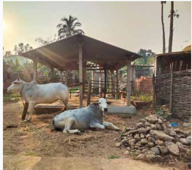
Residents of Bantabori sahi also owned cattle which formed an additional source of income

Upper castes from the village found themselves in strong class position. With sizeable land holdings, they were able to secure credit to buy trucks for coal transportation, while this helped them generate more income, on mine closure, they suffered huge losses. However, by selling off more land, they were able to pay off their debts. Similarly, having land gave them an upper hand economically and most families of Bantabori sahi owned cattle which formed another source of income for them. It is evident how land helped the upper castes in accumulating revenue as well as shielding themselves from mine closure. This privilege is unavailable to the lower castes in the village who barely earn enough for daily food requirements. With no savings and alternative livelihood options, SCs in the village become the most vulnerable community.