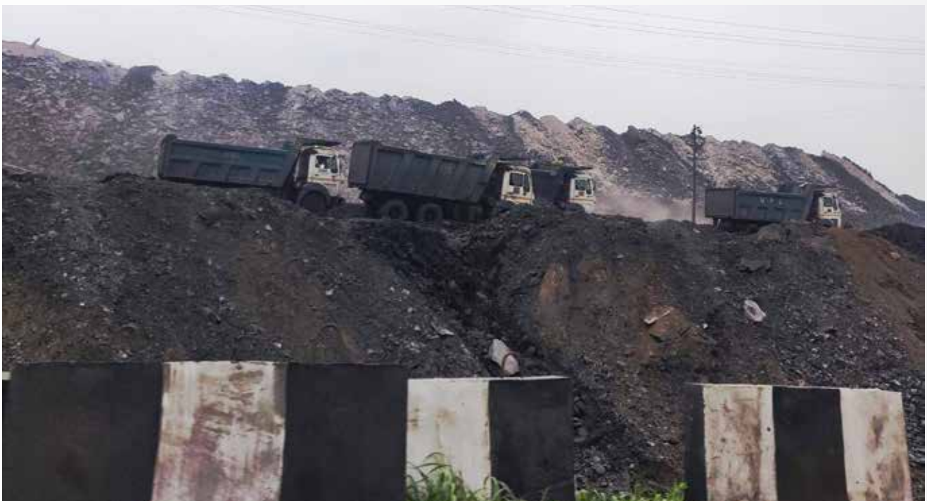
Trucks carrying coal from Kulda OCP in Sundargarh, Odisha.