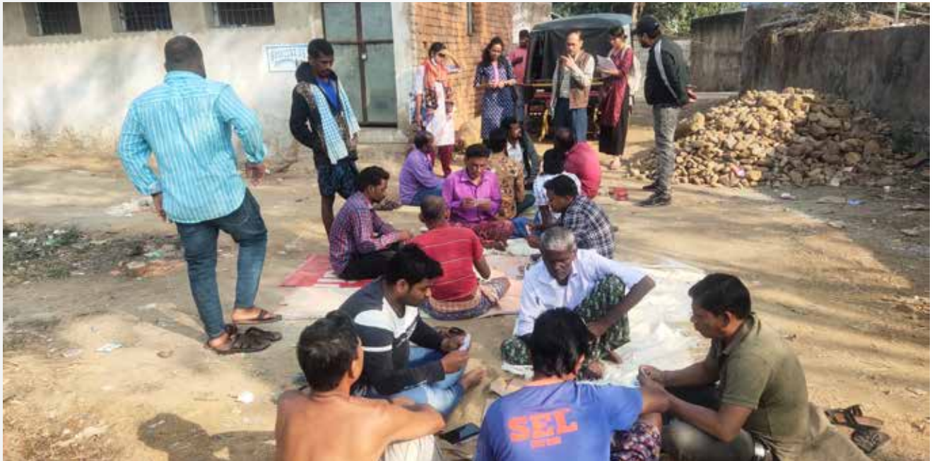
Men of Harijan sahi village of Angul district, Odisha playing cards in the afternoon.

Indian society is a heterogeneous entity layered with diverse linguistic, religious and cultural identities. The lives of the 1.2 billion people are marked by vastly differing everyday experiences and is exposed to varying degrees of marginalisation. While the Indian constitution prescribes no discrimination on the basis of caste, class, sex, religion or descent, this is no guarantee for a truly equitable society. In fact, these identities intersect to produce and reproduce each other and an intersectional nexus is formed where each influences the other. This nexus has an over-arching effect on all spheres of life and through this article we aim to showcase the wide-ranging impacts that such implicit, inherent identities have on our lives.