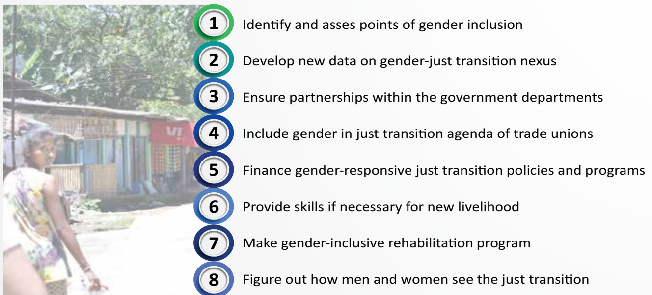
Key points to catalyse a gender-responsive just transition

The first step in putting gender at the centre of a just transition process is to identify, assess, and acknowledge the points of gender inclusion. Second, the raw information, data, and research in this case serve as the basis for making plans to deal with the problems that come with including women in the transition pathway. It will necessitate novel conceptual and analytical research and improved data collection and analysis of gender, notably in relation to just transition policy. Third, government agencies like the labor department, the social welfare department, the women and child development department, and other nodal agencies need to work together to collect data and do research on how the fast changes in energy affect women's jobs and how women can change the way clean energy projects are done. Forth, gender concerns can be a significant component in just transition processes of labour unions and unofficial workers' associations, for example, in North America unions have created initiatives to support apprenticeships, education, and employment opportunities for women in the skilled crafts (NABTU, 2021). Fifth, finance to mitigate gender-specific risks and vulnerabilities that will arise because of energy transition. Sixth, providing women skills and,