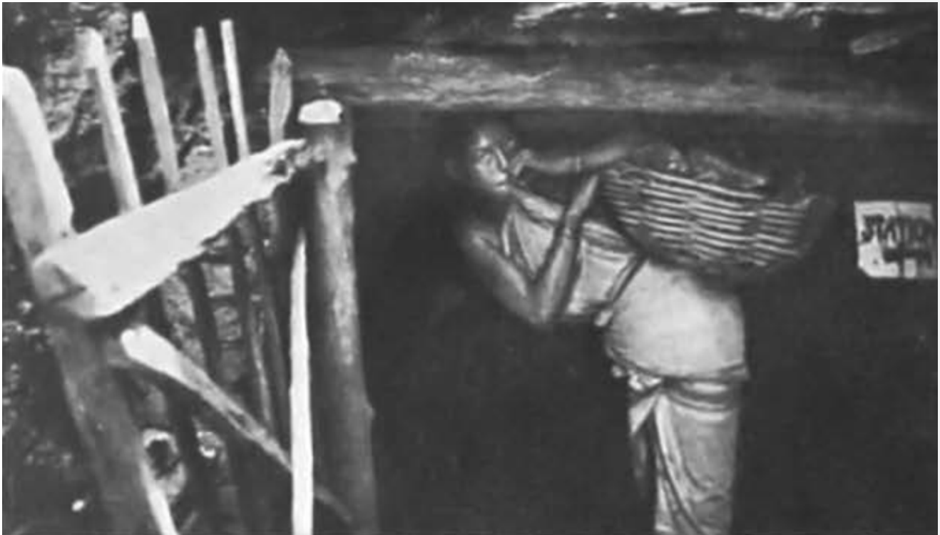
A woman emerging from an incline.

Today's discourse on a just transition away from fossil fuels to cleaner energy is shaped by the broader consensus around climate change mitigation and the need to achieve net zero carbon emissions in order to avoid the catastrophic effects of global warming. If one is to understand the concept of just transition as a primarily labour and employment issue aiming at fair and equitable outcomes for all concerned parties especially those more socio-economically vulnerable - there was a time in the dawn of the scientific-technical era of the world where there was an "unjust" transition. This was the gradual exclusion of women from mining activities in the context of increased industrialisation and mechanisation